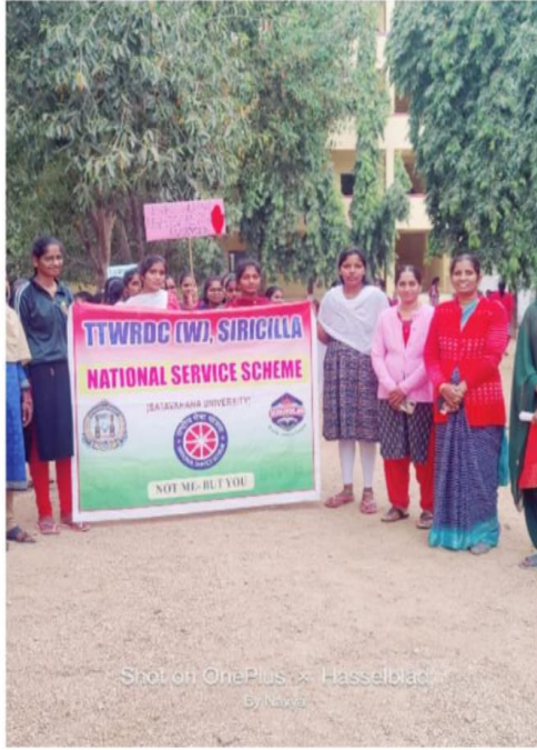
Shot on OnePlus x Hasselblad By Nanya