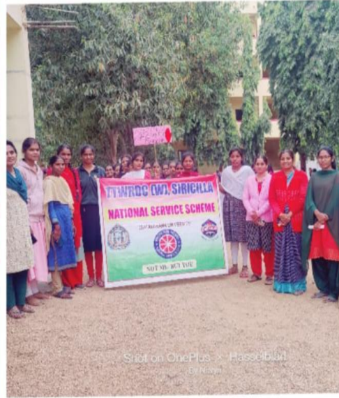
Shot on OnePlus x Hasselblad By Nanya