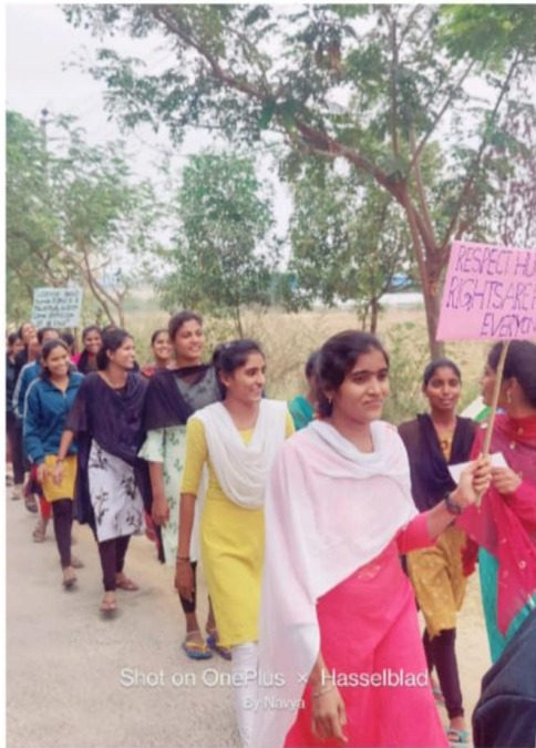
Shot on OnePlus x Hasselblad By Nanya